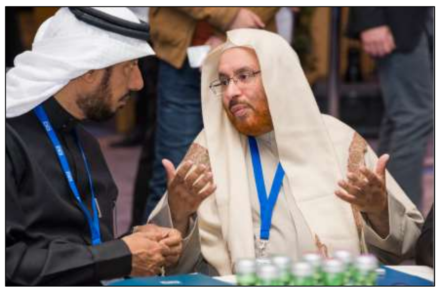
Educators Preserve Plurality through Interreligious Education

• Educators are also crucial partners for KAICIID since they instill in a new generation a culture that will value and preserve social cohesion and dialogue. Together with the Adyan Foundation, a Lebanese NGO that fosters interreligious understanding and social engagement, as well as with other regional partners, KAICIID will convene a conference in April 2015 to support interreligious and intercultural education in the Middle East.