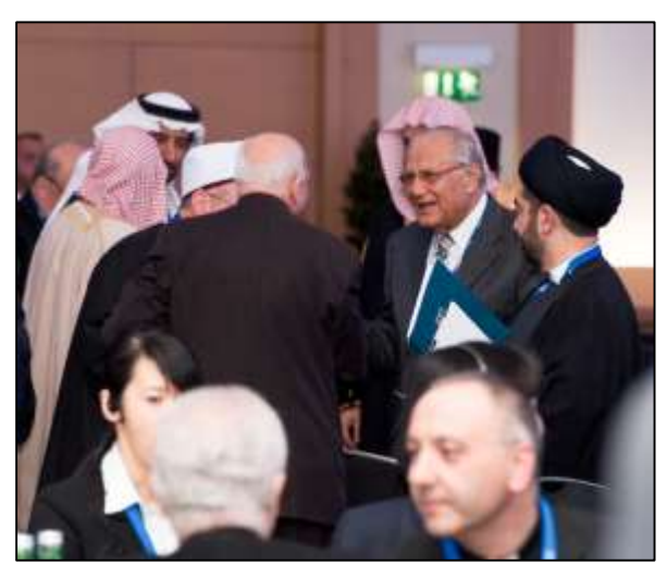
Muslims and Christians.

fabric of those communities. We also affirm that each person is vital to the future of these countries as they coexist equally with the same rights and duties to create solidarity between the Muslims and the Christians in the Middle East. Therefore, we call for the preservation of this diversity in the Arabic societies, which has been our legacy for several millennia. Diversity is both a cultural prerogative and an authentic source that reflects the different elements comprising the national identity. We proclaim the imperative need for Christians, Muslims, and other cultural and religious components to become a cohesive unit in Arab societies.