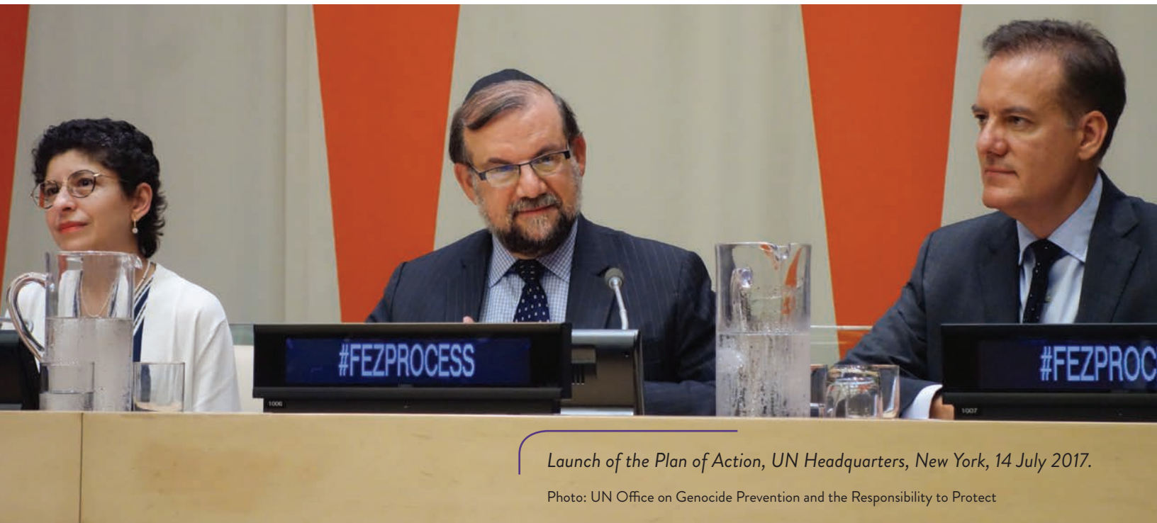
Launch of the Plan of Action, UN Headquarters, New York, 14 July 2017.