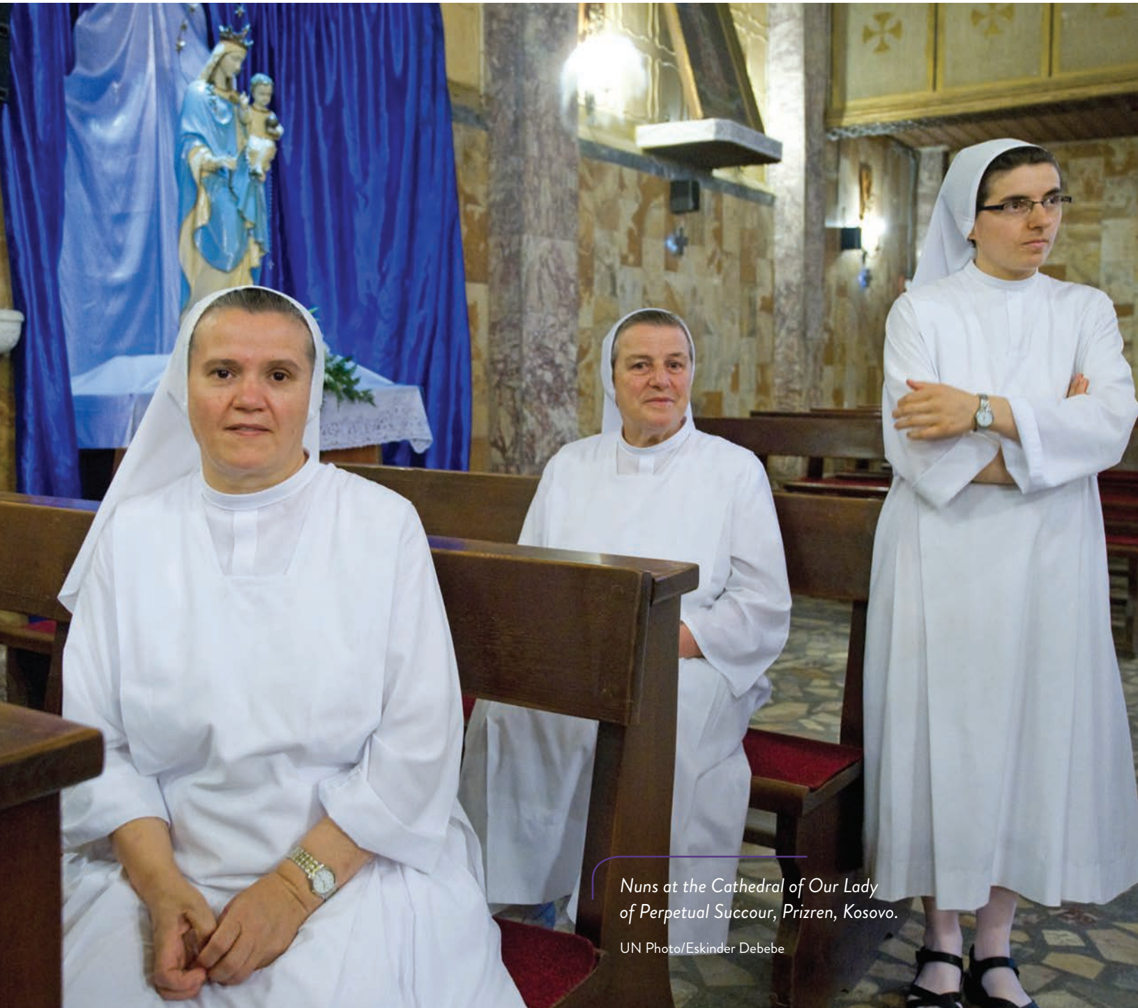
Nuns at the Cathedral of Our Lady of Perpetual Succour, Prizren, Kosovo.

Religious leaders and actors can be strong partners in the prevention of atrocity crimes and their incitement and, for this reason, national, regional and international institutions, civil society and the media should engage and cooperate with religious leaders in the context of efforts to prevent atrocity crimes.