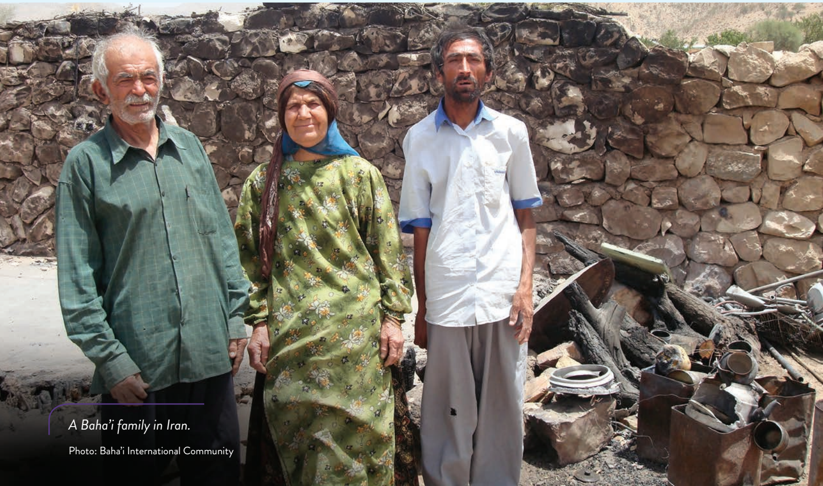
A Baha'i family in Iran.