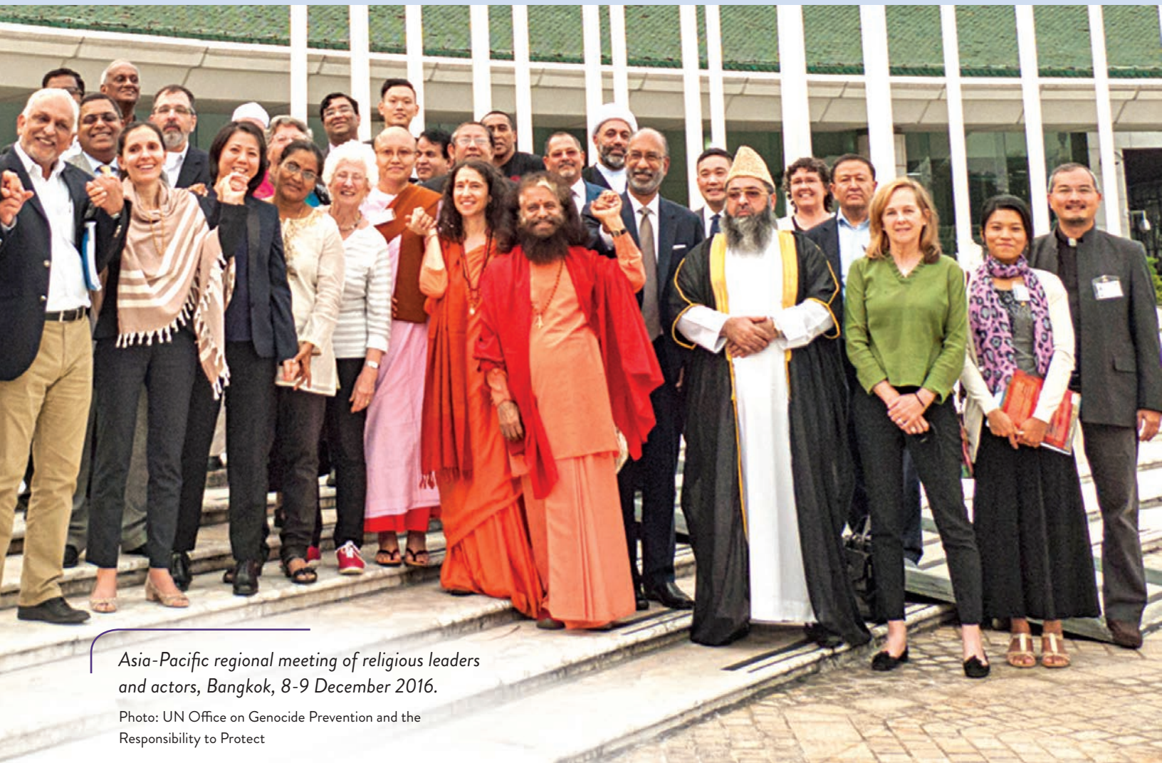
Asia-Pacific regional meeting of religious leaders and actors, Bangkok, 8-9 December 2016.

of religion, such as early or forced marriage and sexual slavery. Members of the network/coalition should keep each other informed about any measure taken to prevent, counter and respond to instances of incitement; initiate joint statements/responses; and coordinate actions, including through social media.