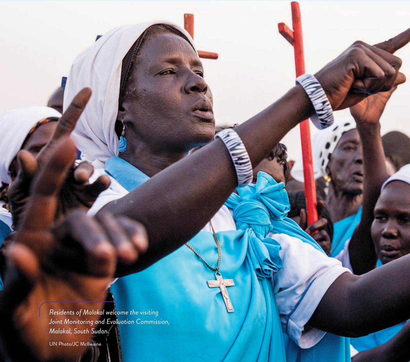
Residents of Malakal welcome the visiting Joint Monitoring and Evaluation Commission, Malakal, South Sudan.