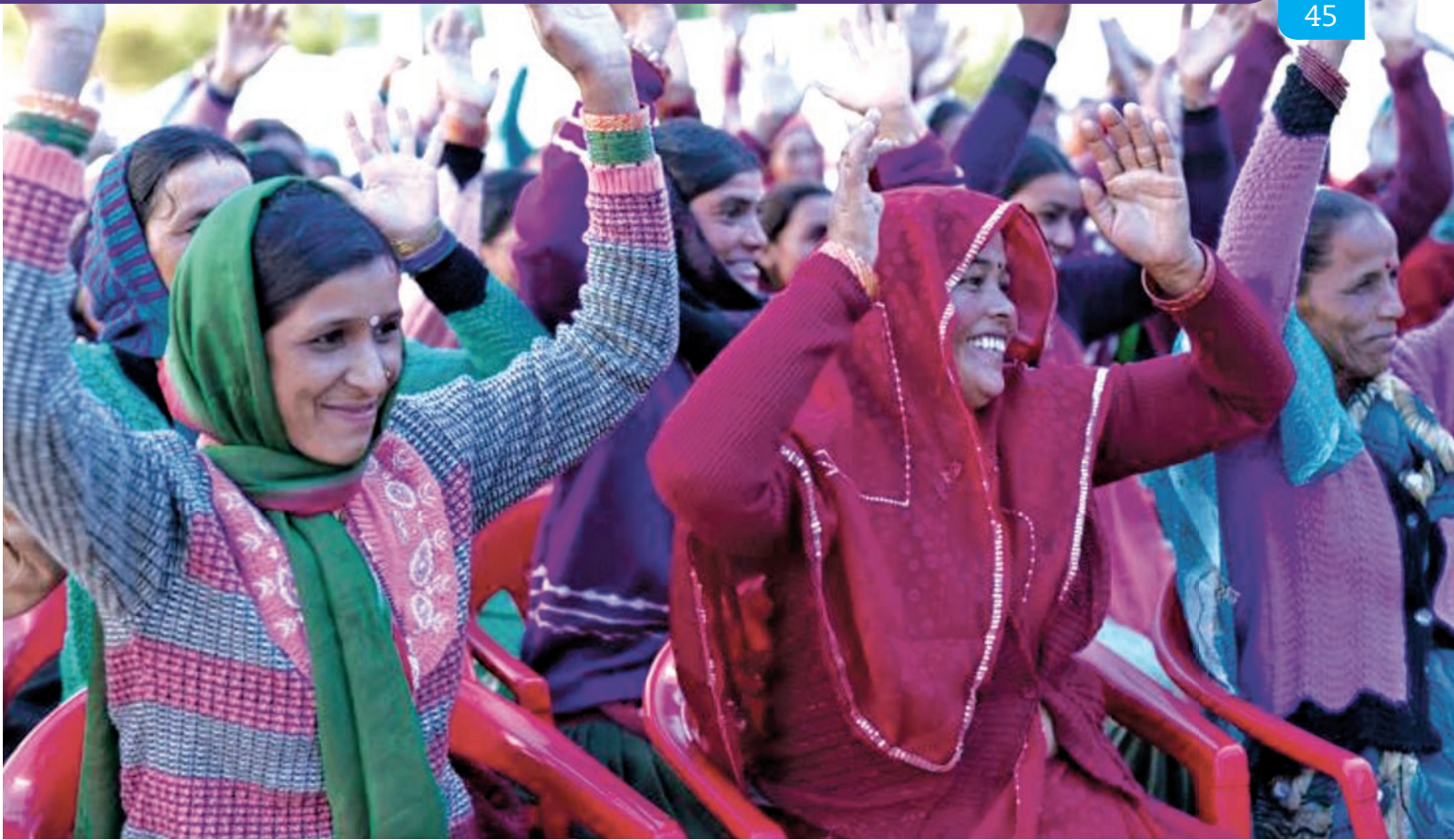
Hindu women at the Triyuginarayan Centre, India.