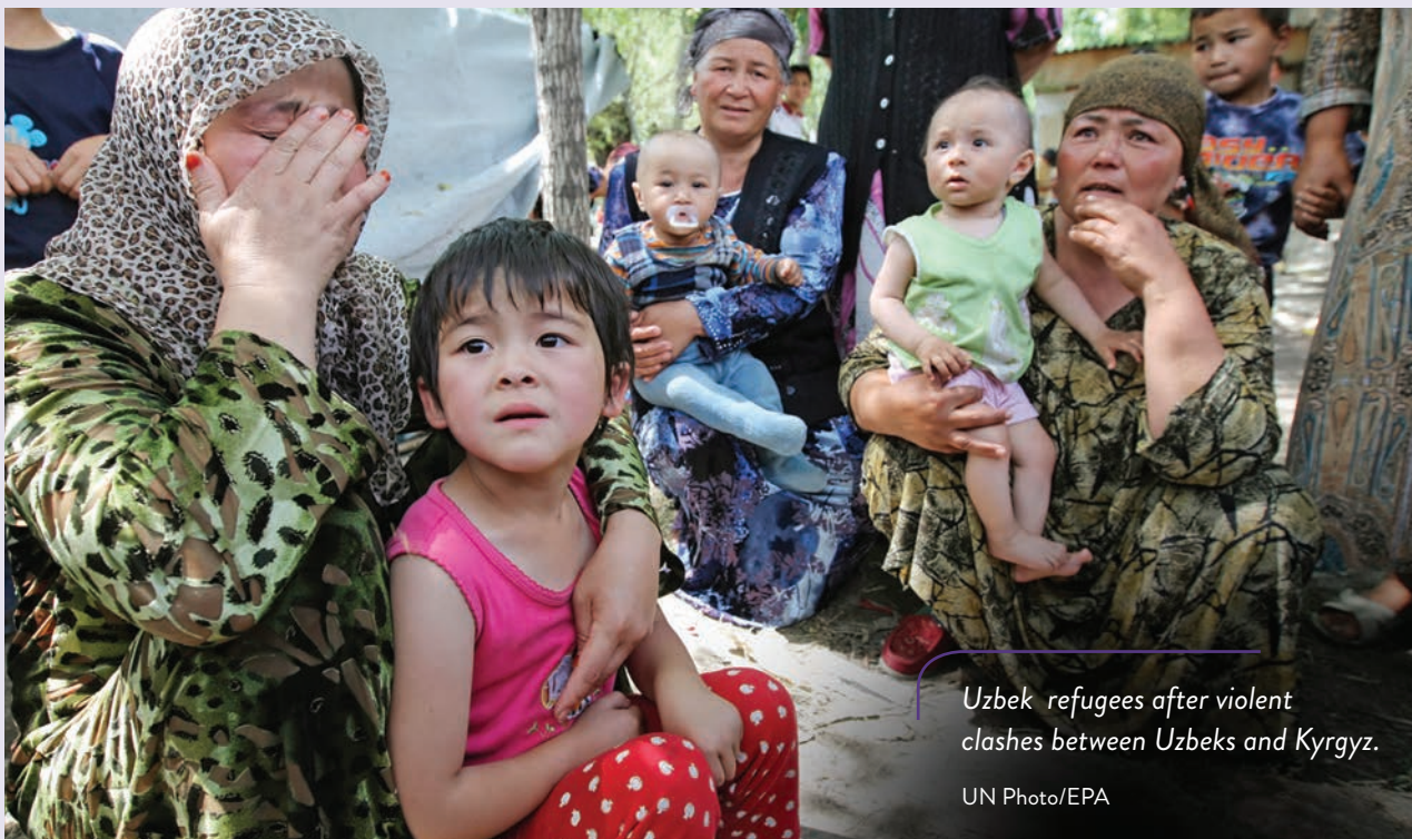
Uzbek refugees after violent clashes between Uzbeks and Kyrgyz.