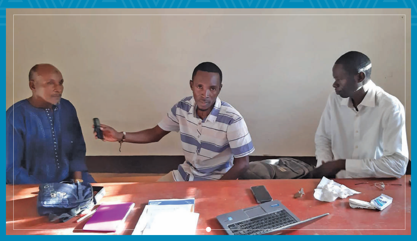
KAICIID-trained journalists in Sibut (central CAR) broadcast a special radio programme on the situation of Fulani herders, April 2019, as a follow-up to the trainings on conflict sensitive journalism.