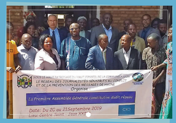
General Assembly of the "Network of Journalists Sensitive to Conflict" September 2019